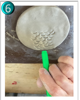
Use the end of a pen to make feather shapes on the bottom half of the circle.