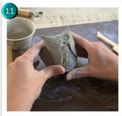
Press the owl onto the scratched part of the pot. Smooth the bottom of the owl underneath the pot.