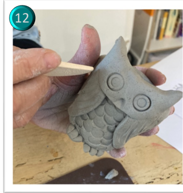
If you want, you can add more detail such as feet, a beak or more feathers.