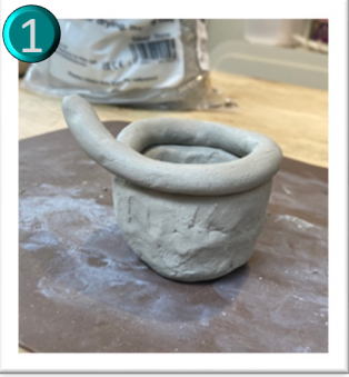
Using a coil or pinch pot technique, make a basic pot about 10cm high.