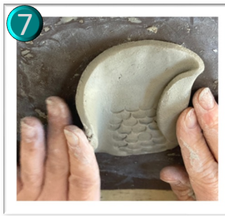
Fold in the two outside edges of the circle to make wings