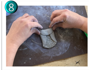
Fold over the top bit of the circle and pinch to make the owl's ears.