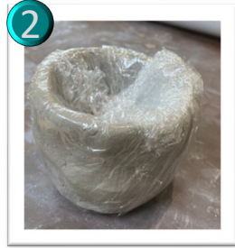
Wrap the pot in cling film to stop it from drying out.