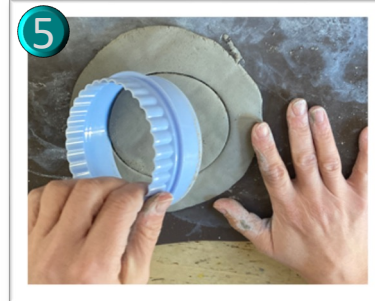
Cut out a circle from the clay.