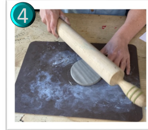
Flatten it until it is the same depth as two pennies.