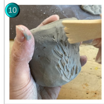
Unwrap your pot and make some scratches where you want the owl to stick on.